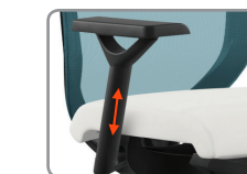
A40 HEIGHT ADJUSTABLE ARM