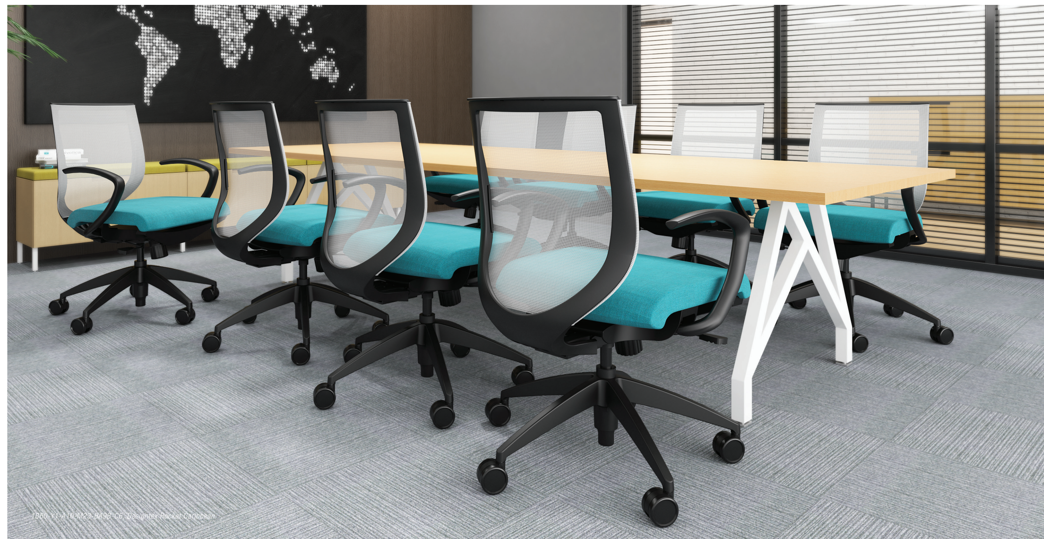
1880-Y4-A40-M23-BA99-C6-LB; Momentum Epic Capris Blue