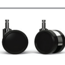
C7 CHROME-ACCENTED HARD FLOOR AND CARPET CASTERS