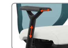
A41 HEIGHT ADJUSTABLE SLIDE ARM