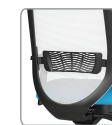
LB HEIGHT ADJUSTABLE LUMBAR SUPPORT