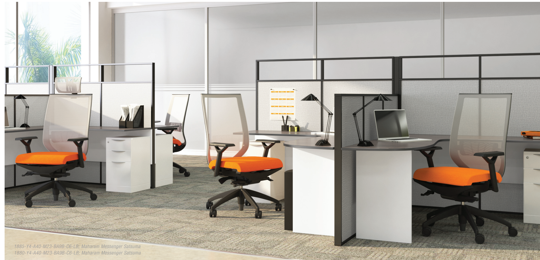
1885-Y4-A40-M23-BA99-C6-LB; Maharam Messenger Satsuma 1880-Y4-A40-M23-BA99-C6-LB; Maharam Messenger Satsuma