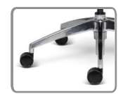
BA10P 26" HIGH PROFILE ALUMINUM BASE POLISHED