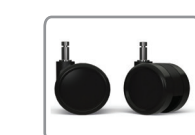
C6 LARGE DIAMETER CARPET CASTERS