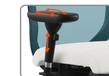
A6 HEIGHT ADJUSTABLE PIVOT/SIDE ARM