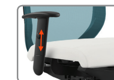
A8B/S HEIGHT ADJUSTABLE ARM BLACK/SILVER