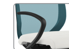
A10 SOFT TOUCH C-SHAPED ARM