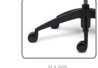
BA9B 26" HIGH PROFILE NYLON BASE BLACK