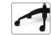
BA10B 26" HIGH PROFILE ALUMINUM BASE BLACK POWDER COAT