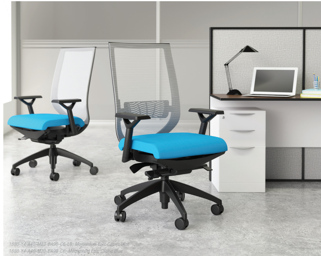
1880-Y4-A40-M23-BA99-C6-LB; Momentum Epic Capris Blue 1880-Y4-A40-M23-BA99-C6-LB; Momentum Epic Capris Blue