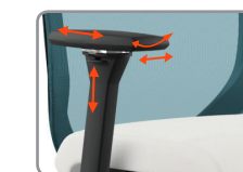
A36 HEIGHT ADJUSTABLE PIVOT/SLIDE ARM