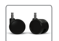
C6S LARGE DIAMETER HARD FLOOR AND CARPET CASTERS