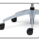
BA10S 26" HIGH PROFILE ALUMINUM BASE SILVER POWDER COAT